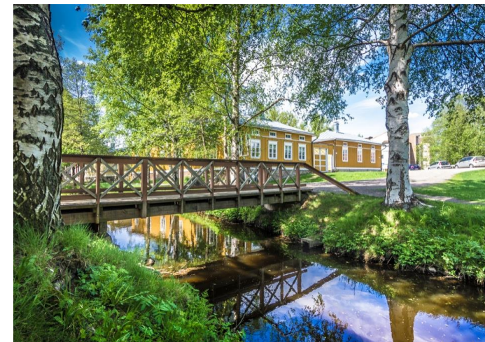
Old Rauma