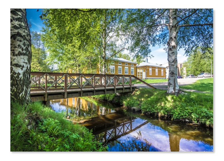
Old Rauma, Photo CC: http://shaynethomas.com

World Heritage Site managers Destination managers Interested tourism professionals